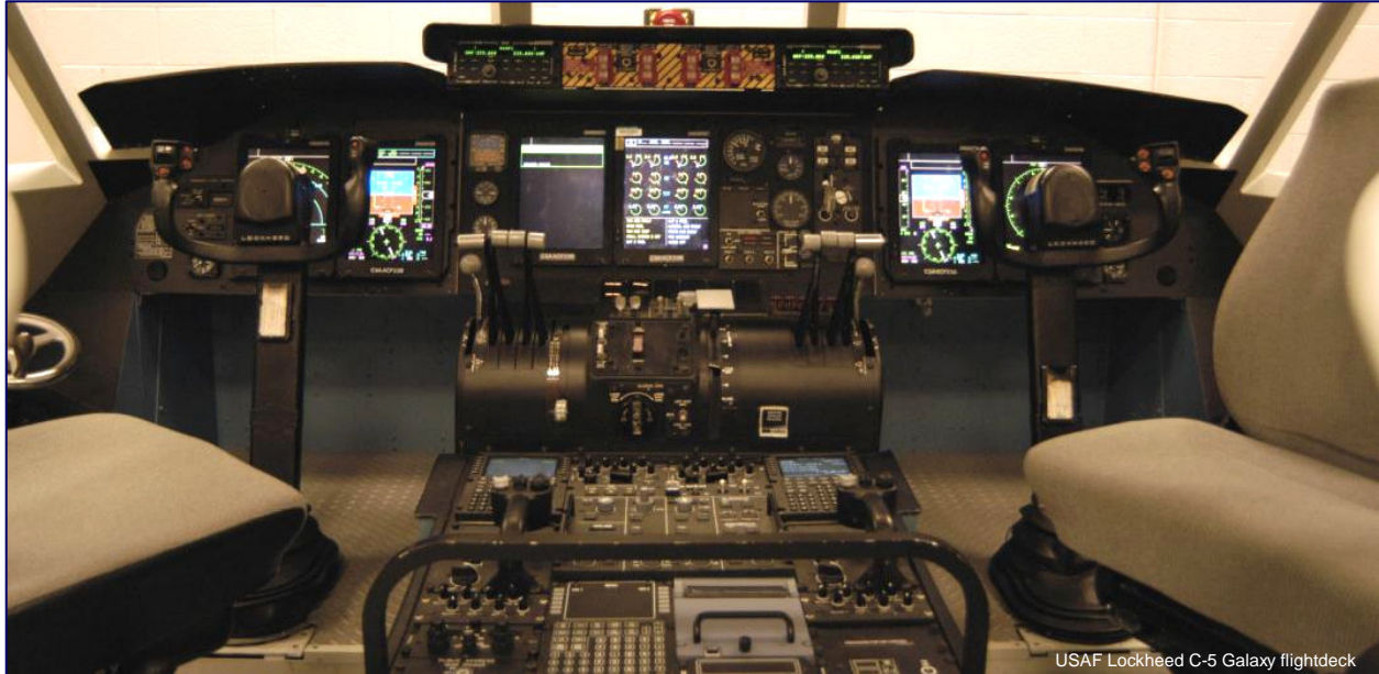
USAF Lockheed C-5 Galaxy flightdeck